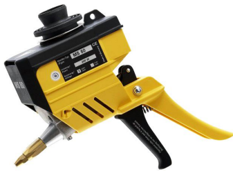
MS80 #5551 (230 V)