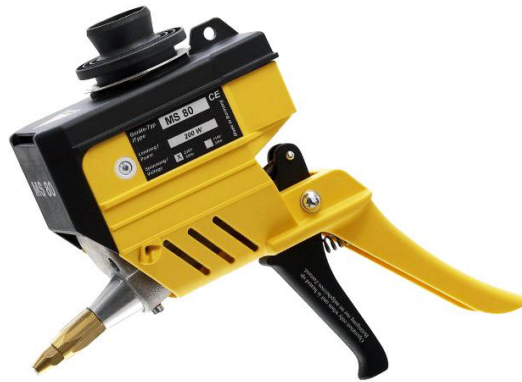
MS80 | #5551