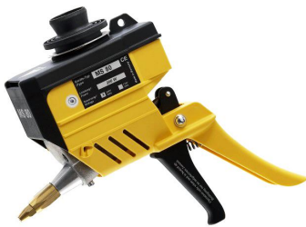
MS80 #5551 (230 V)