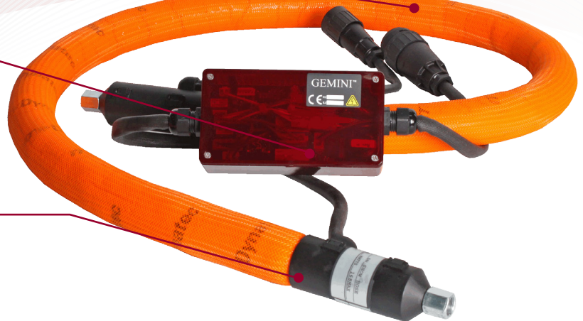
ITW Dynatec - Gemini™ Automatic Hot Melt Hose

Competitive hose configurations available with Gemini™ technology.