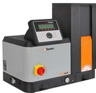
Dynamelt® S 5/10/22/45 kg Number of Hoses 2-4-6