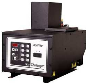
Quattro® 9 kg/h; tank 5 kg Number of Hoses 4