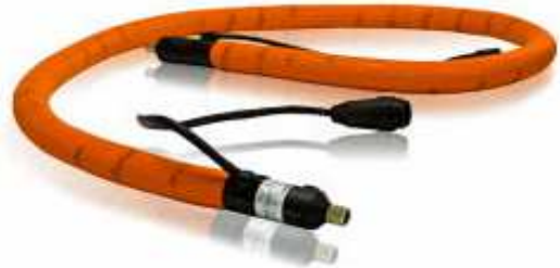
DynaFlex® hose L = 1.2-7.3 m