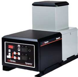
Dynamini® 8 kg/h; tank 5 kg Number of Hoses 2