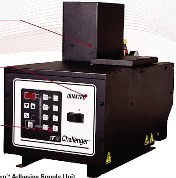
ITW Dynatec - Quattro™ Adhesive Supply Unit

Icon-driven control panel simplifies operations.