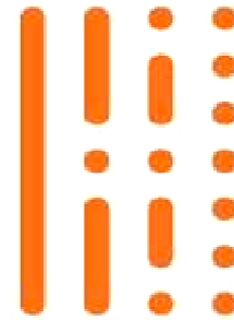
"Bead & Dot"

Height (H) - 96 mm Depth (D) - 81 mm Width (W) - 44 mm